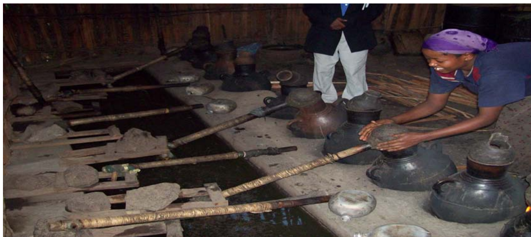
Photo 3 A lady producing katikala

As it is indicated previously income generation, employment creation and food security are the benefits of katikala production. To maximize these benefits households produce katikala in different frequencies starting from once per week to seven times a week. In rural areas, it was mentioned earlier that katikala production is a supplementary source of livelihood. Hence the majority of these households produce once per week. However most of the urban households produce katikala three times a week. This is due to the fact that it is the main means of livelihood strategy for these households. See also table 14.