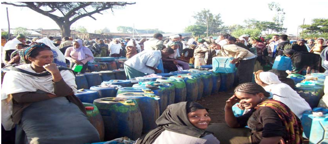
Photo 4 Katikala market

Then the produced katikala have been sold in 8-10 birr per liter with a gross income that ranges from 160 to 250 birr. In addition the katikala producers had benefited from the byproduct by using themselves for cattle fattening or selling a one time byproduct (approximately one barrel) with 20-30 birr for cattle fatteners.