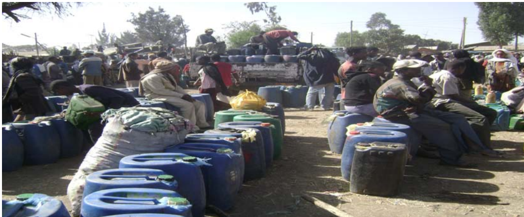
Photo 1 Cars loading katikala that creates employment for individuals and generates revenue for the town municipality through taxation

Means of livelihood for households /producers through generating income, employment creation and food security is the other benefit. In the literature review it was indicated that livelihood comprises the capabilities, assets and activities required for a means of living.