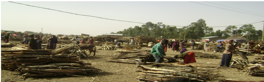
Photo 5 Fuel wood market

It was indicated previously that much of the labor required in relation to katikala production is covered by household members mainly wives and daughters. Here households were asked for the presence of children in their family and as it was seen from table 18, 79.7 % of rural and 73.6 % of urban respondents have children. Of these 88.2 % of rural and 93.8 % of urban households send at least one child to school. From these 31.1 % of rural and 38.2 % of urban respondents replied that katikala production has created a problem in the performance of children in their education. This is due to several factors in the form of competing study time, shortage of time to do home work ,inability of attending classes and lack of attention during class attendance. Some of factors that affect students' educational performance negatively are collecting fuel wood, fetching water, producing katikala, selling katikala and drinking katikala. Of these factors table 18 also