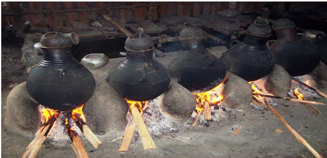
Photo 7 Existing katikala production process

In sum katikala production has both benefits and problems for the study area in general and the respondents in particular. These households are planning in the future to maximize benefits and minimize problems. Despite the fact that they are facing different problems, table 20 has shown that the majority of rural households (54.7 %) and urban households (43.6 %) had replied that they are planning to expand katikala production and start another business in addition to katikala production respectively. However, households seek assistance from government and non government organizations to avoid or minimize the early listed problems (health problems, losses, scarcity of inputs and high