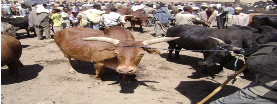
Photo 2 Fattened cattle market

This shows that rural livelihood in the study area is predominantly dependent on agricultural income; despite the fact that agricultural productivity and income diversification remain low and households are vulnerable to climatic changes especially due to deforestation for fuel wood and high rate of population growth. As a result in Ethiopia in general and study area in particular, underemployment and unemployment of youth and women are major challenges for the government. Hence the creation of employment and income generating activities in the formal and informal sectors could be the best way out. One of employment creation and income generating activity in the informal sector is katikala production. According to a key informant from the woreda Agriculture and Rural Development Office, most of the residents of Arsi-Negele town (more than 90 %) are producing katikala with the majority of them hiring a maid servant, and mainly in relation to this activity there are about 415 carts and 400 grinding mills in the town. Thus katikala production and its related activities are widely used livelihood strategies in the Arsi-Negele town and other katikala producing rural kebeles due to several reasons such as lack of land in rural areas, and shortage of finance to start another