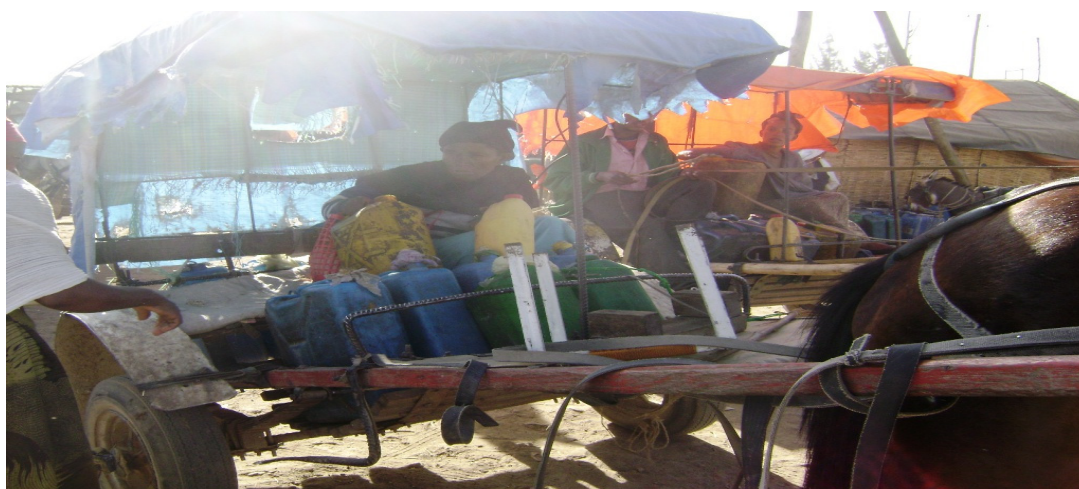
Photo 6 Individuals traveling to the market for selling katikala

Health problems are the other major problems of katikala production. As it is shown in table 19 only 25 % and 30% of rural and urban producers respectively were sick at least once in 12 months prior to the survey. Of these sick respondents most of them have got treatment after the cases were investigated by health professionals.